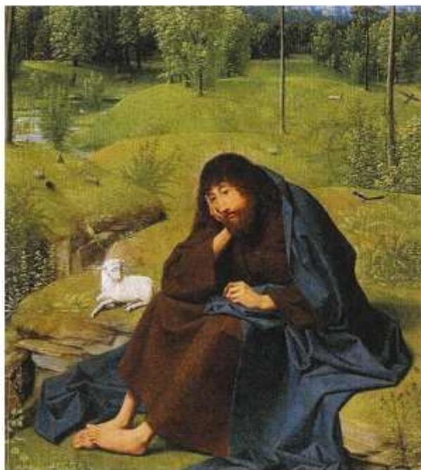
Saint John the Baptist in the Wilderness by Geertgen tot Sint Jans

Loving God, As we keep this Advent time, awaken our hearts to goodness and hope. Help us to hear your voice. Strengthen our voices as we work towards building a world where justice reigns. Through Christ, our Lord, Amen.